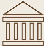
Multipurpose Hall (can fit 2 badminton courts)